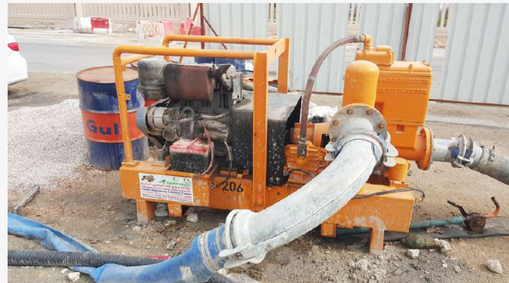
15 Project in Al-Ahsa