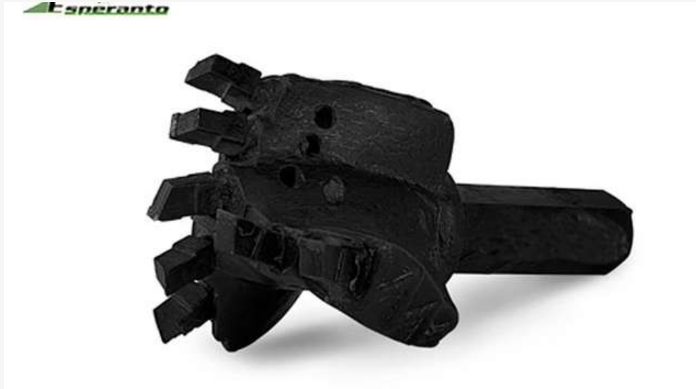
1 Drill Head