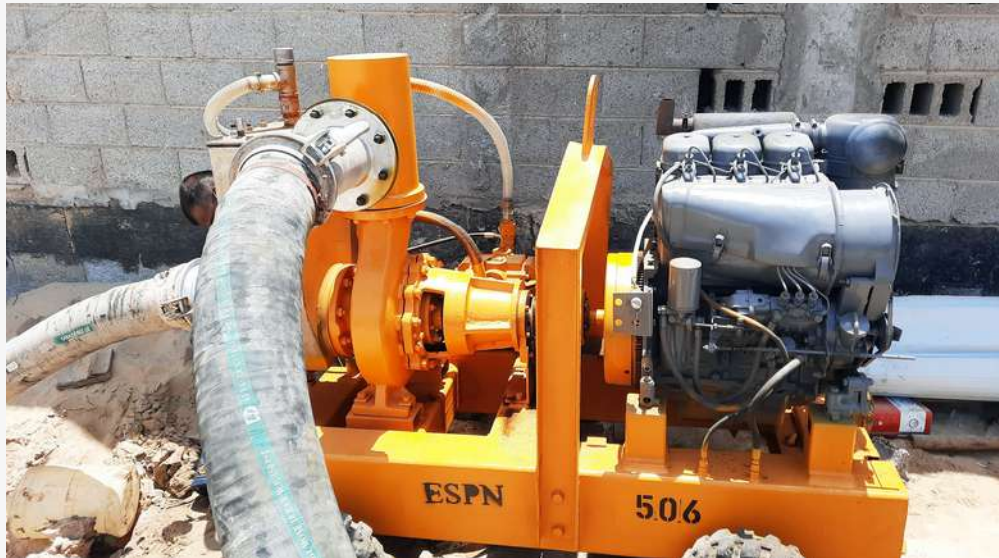
05 Project in Aziziya