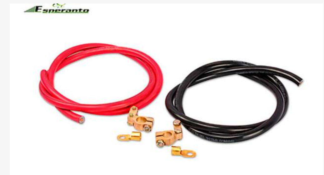
12 Battery wire