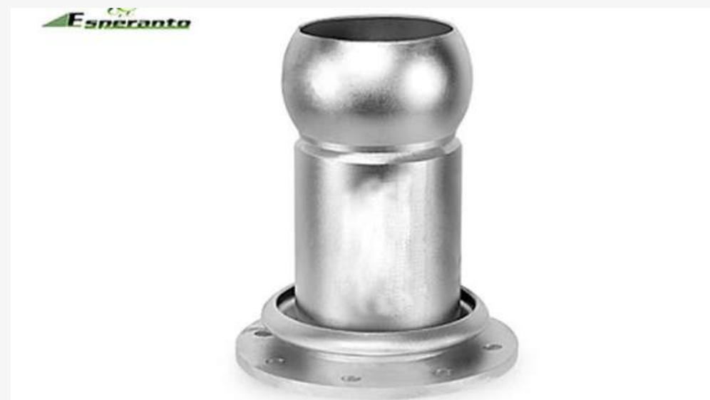
5 Male flange fitting