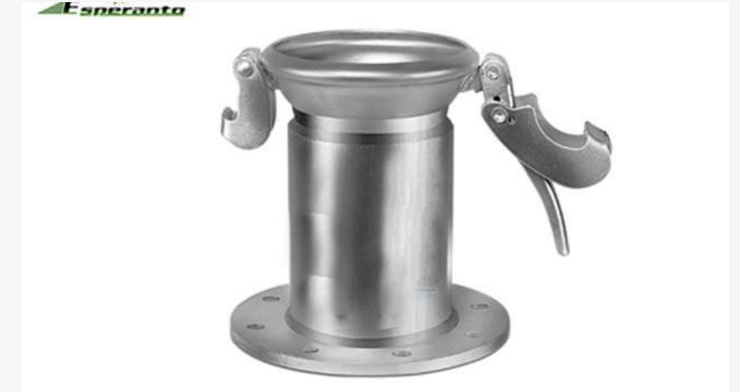
3 Female flange fittings