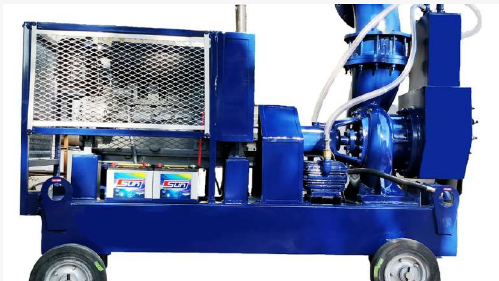
12 inch dewatering pump