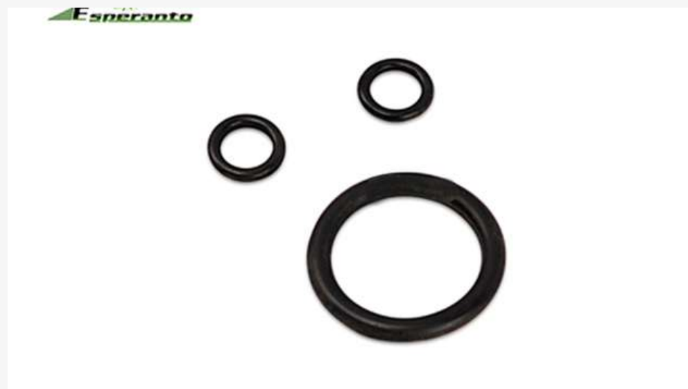
11 O rings