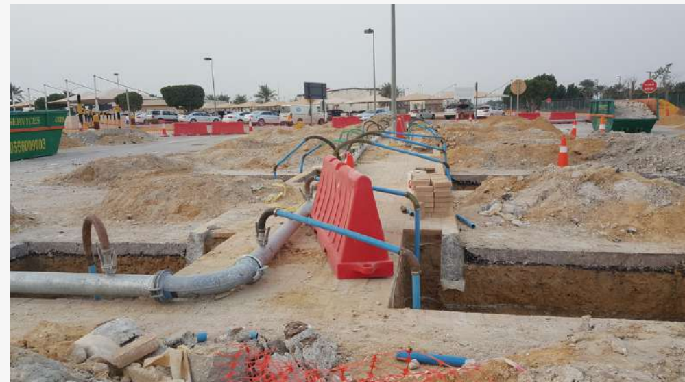
27 Project in Abqaiq