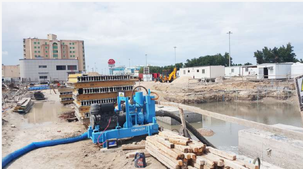
14 Project in Dhahran