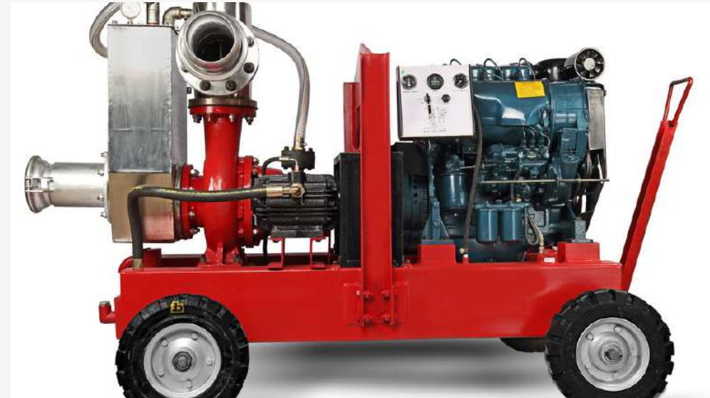
6 inch dewatering pump