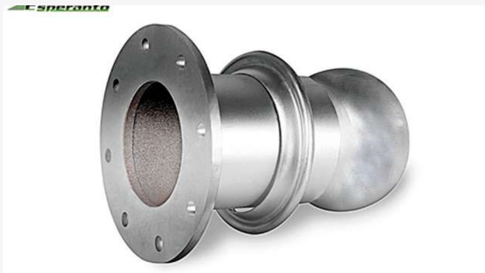
4 Male flange fitting