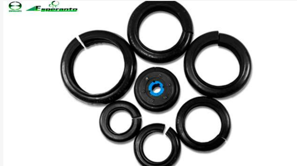
8 Tyre couplings