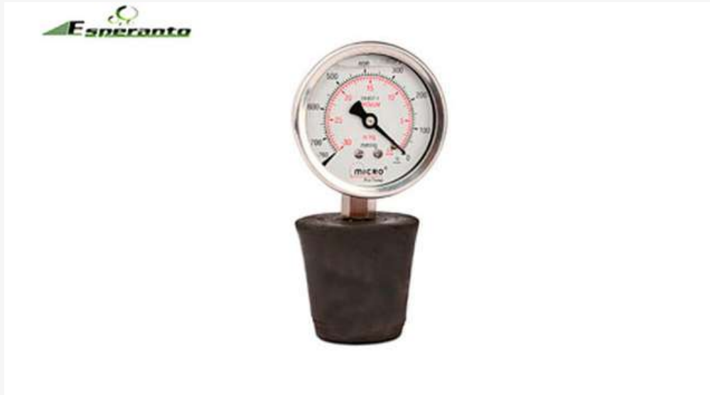
7 Vaccum gauge