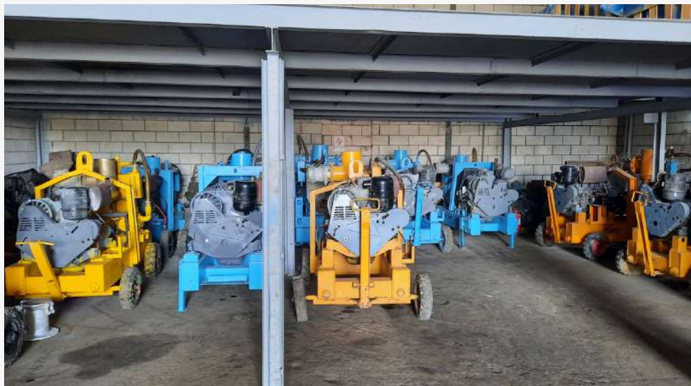
08 Project in Dammam