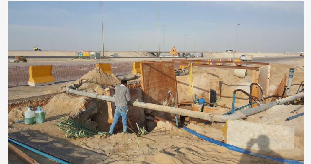
25 Project in Jouf