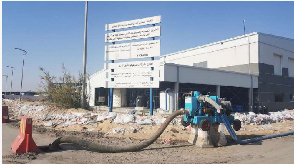
17 Project in Tabouk