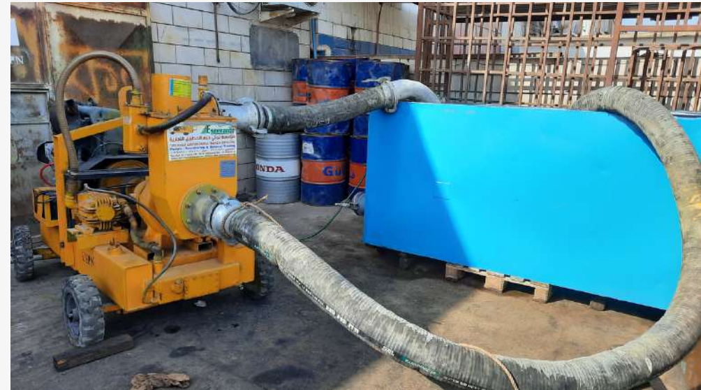
12 Project in Jeddah