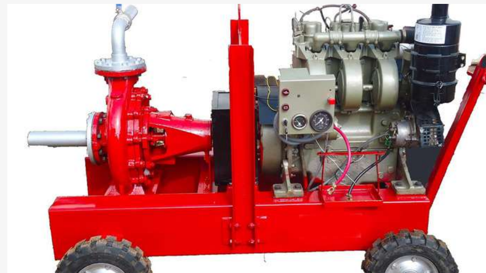
3 inch Jetting pump