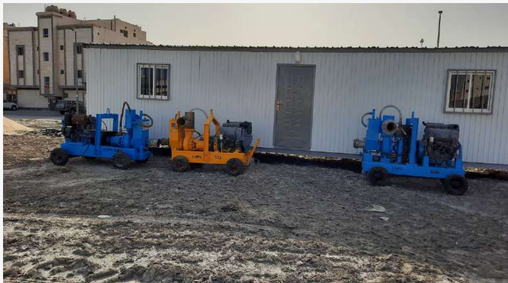
26 Project in Yanbu