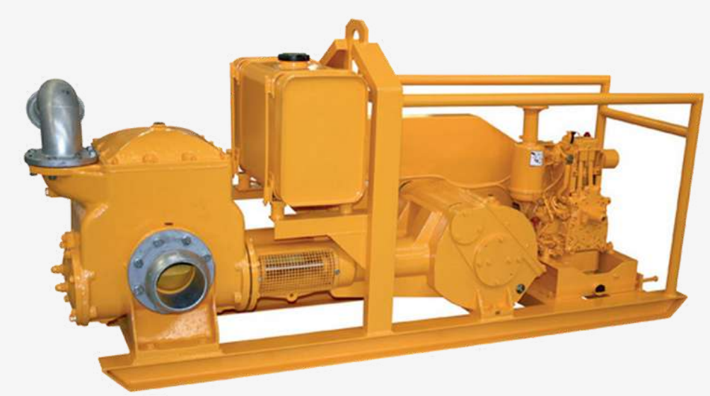
6 inch Piston type dewatering pump