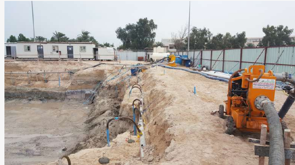
18 Project in Abha