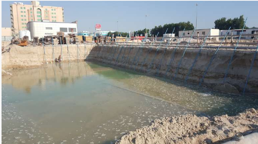
23 Project in AL-Madinah