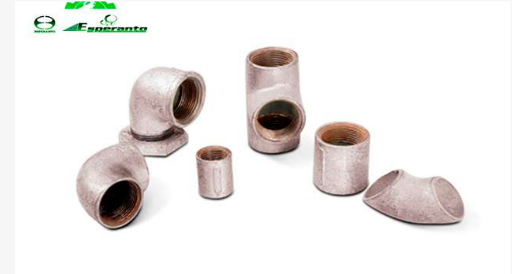
9 GI fittings