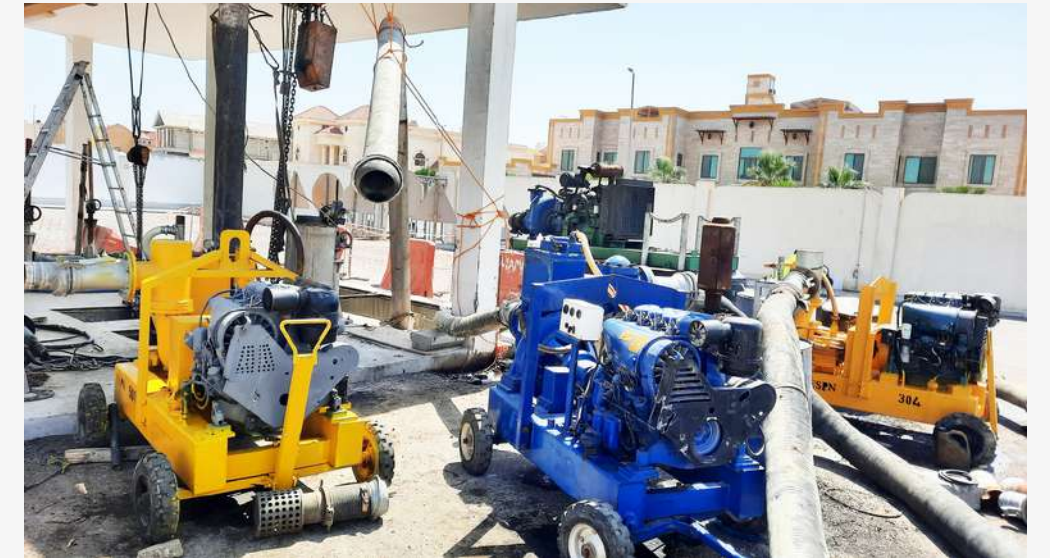
07 Project in Al-Kharj