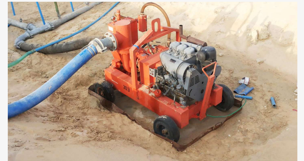
16 Project in Taif