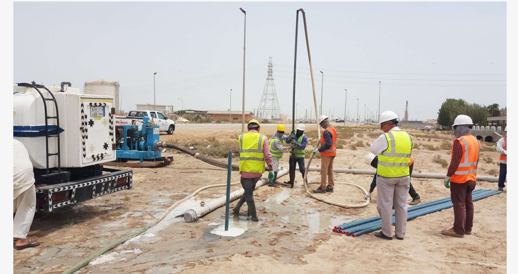
13 Project in Riyadh