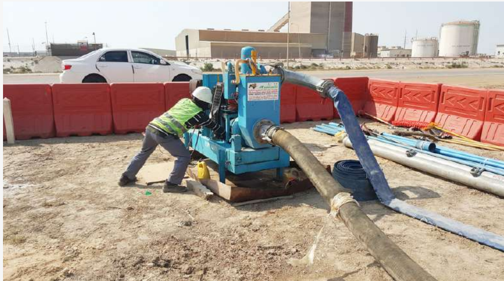
11 Project in Jubail