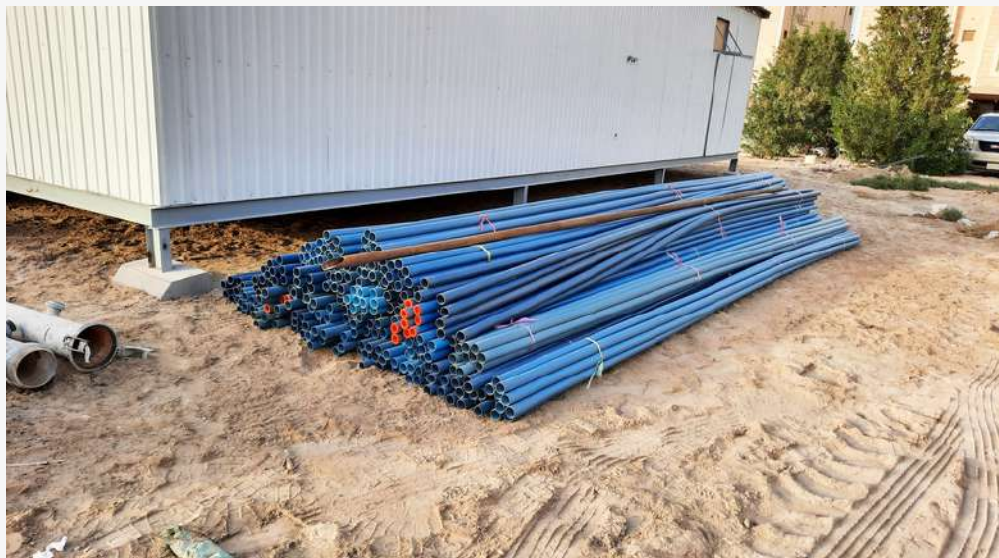
20 Project in Jizan