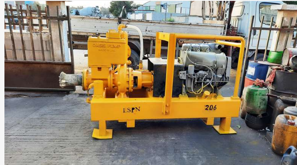
06 Project in Jubail