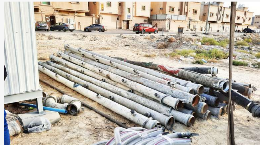
21 Project in Najran