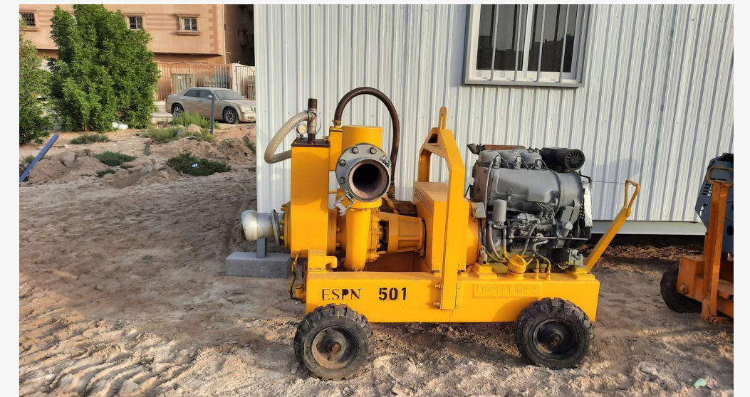
28 Project in Al-Jawf