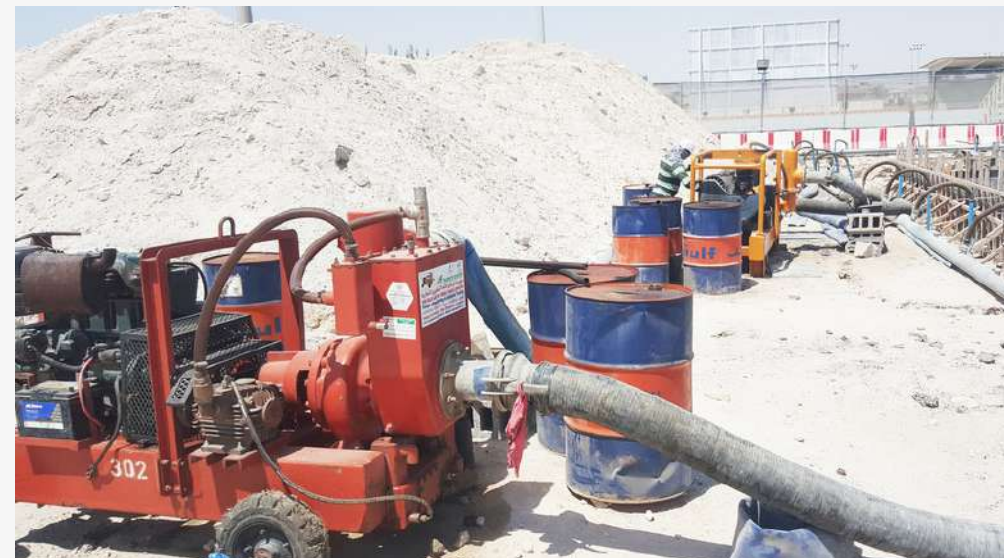
09 Project in Riyadh