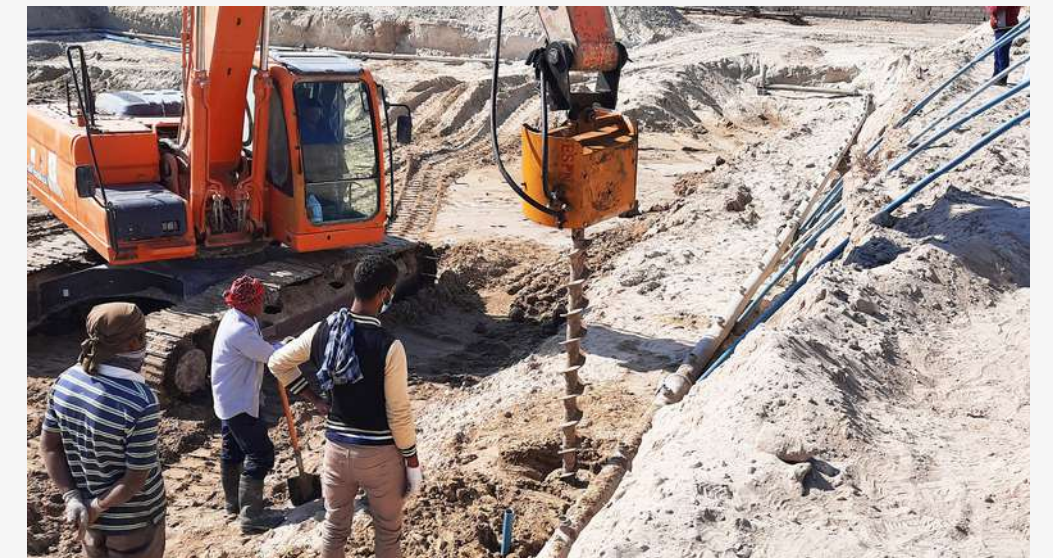
22 Project in Hail