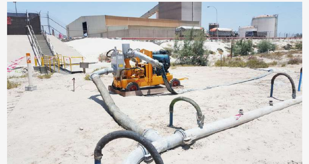
10 Project in Buraydah