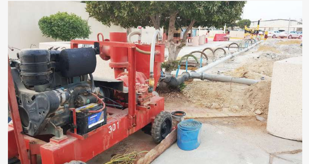
19 Project in Al Baha