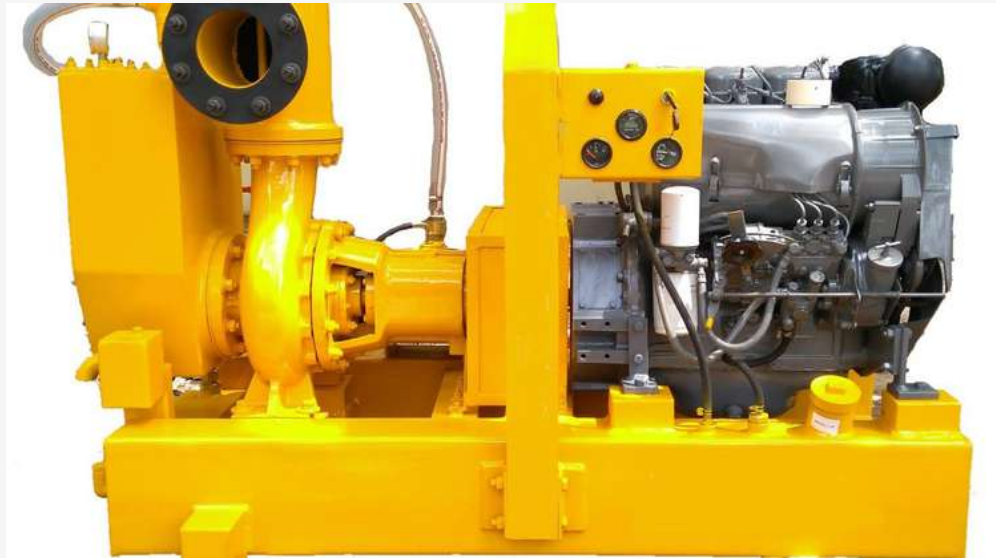
4 inch dewatering pump