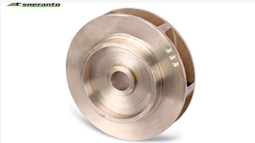
10 6 inch impeller