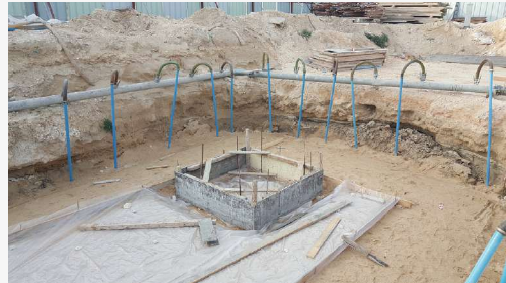
24 Project in Al Qaseem