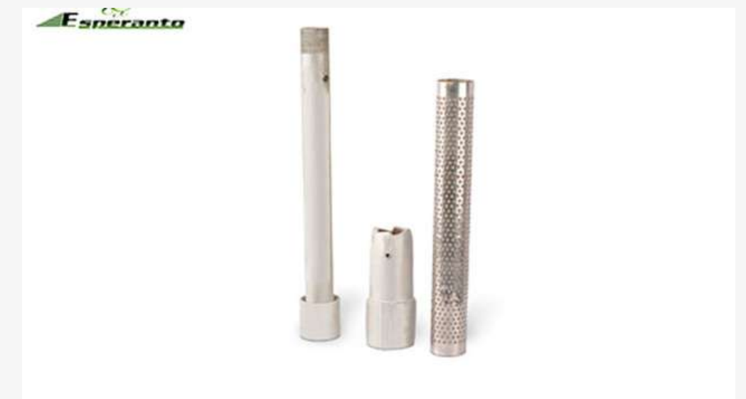
6 SS wellpoints